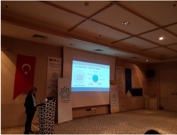
Spain ESPACIO – PPT