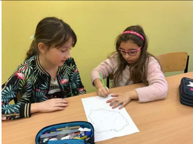
3 Creating a project of your own coat of arms.