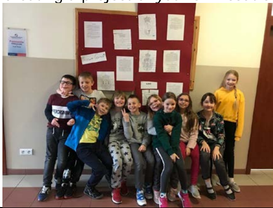
4 Presentation and discussion of the drawing of own coat of arms